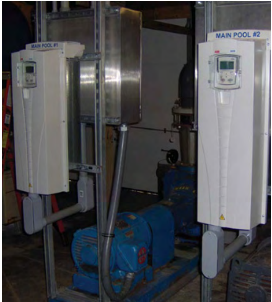
ABB drives added to operate varying pumping requirements of pools at Windsor, CT.

tech was able to “User load curves” as a preventative safety measure, using the Drives WindowLite program. They determined the amperage draw when the pumps lost prime, padded the number a little, and programmed the drives to trip on a fault whenever that low amperage limit is hit.